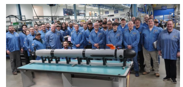
Expanded UUV Capacity