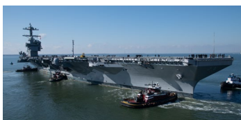
CVN 79 Builder's Sea Trials